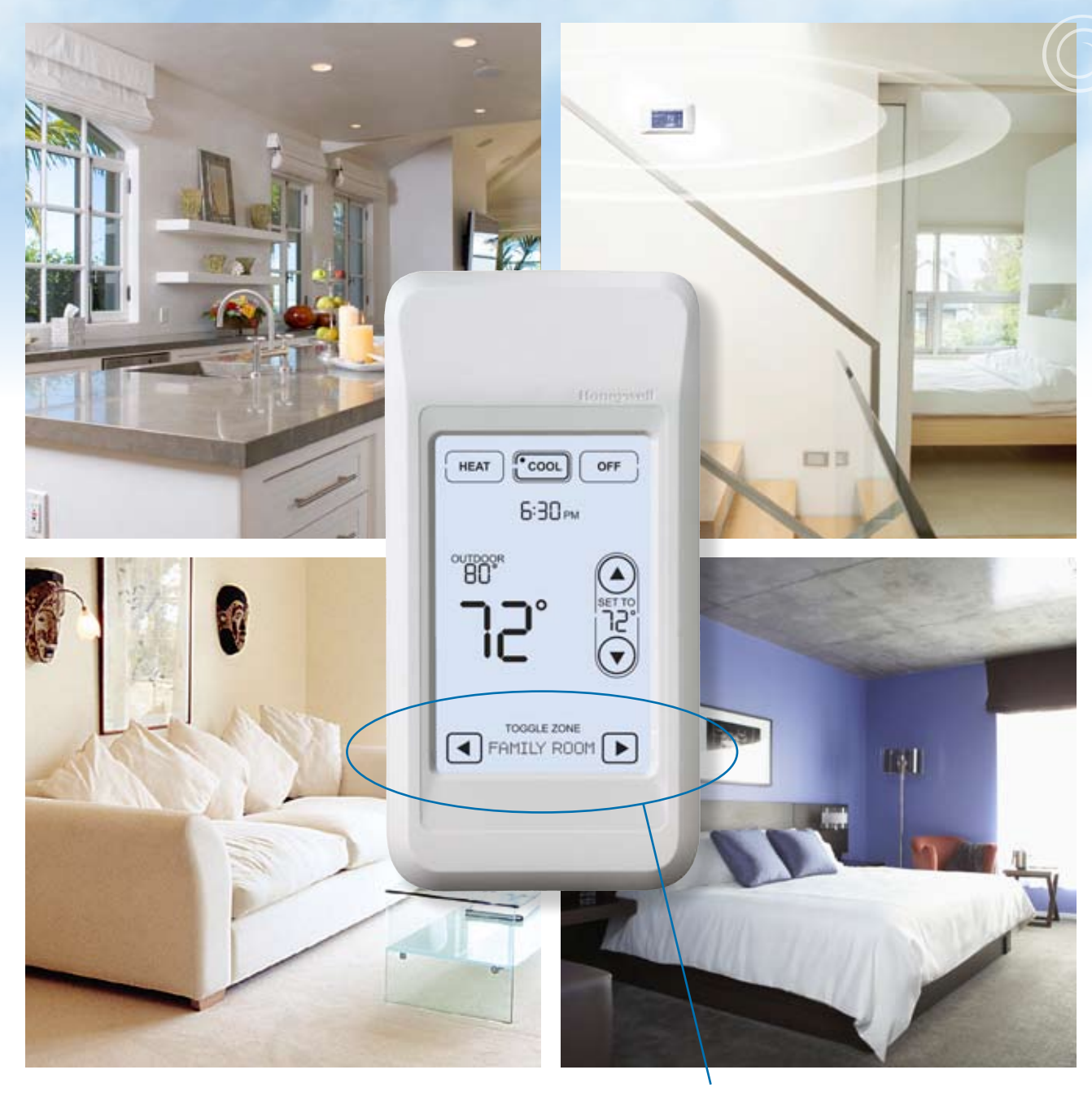
Toggle between zones to set the temperature in any zone from anywhere in the home

The Portable Comfort Control also maintains the schedule from your programmable thermostat. Easily adjust the temperature setting before bedtime to set-back for energy savings after you fall asleep — or turn the system off for easy overnight energy savings.