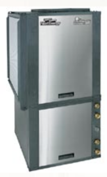
Tranquility 20<sup>TM</sup> Unit

What can you do to protect your family from this costly trend? Reduce your consumption of energy. You can improve your home's 'energy efficiency' with better appliances, more insulation, and newer or fewer windows...but did you know that over 50% of your utility costs come from heating, cooling, and hot water? Now that's something you can control...it's called the Tranquility20<sup>TM</sup> geothermal system from NextEnergy.